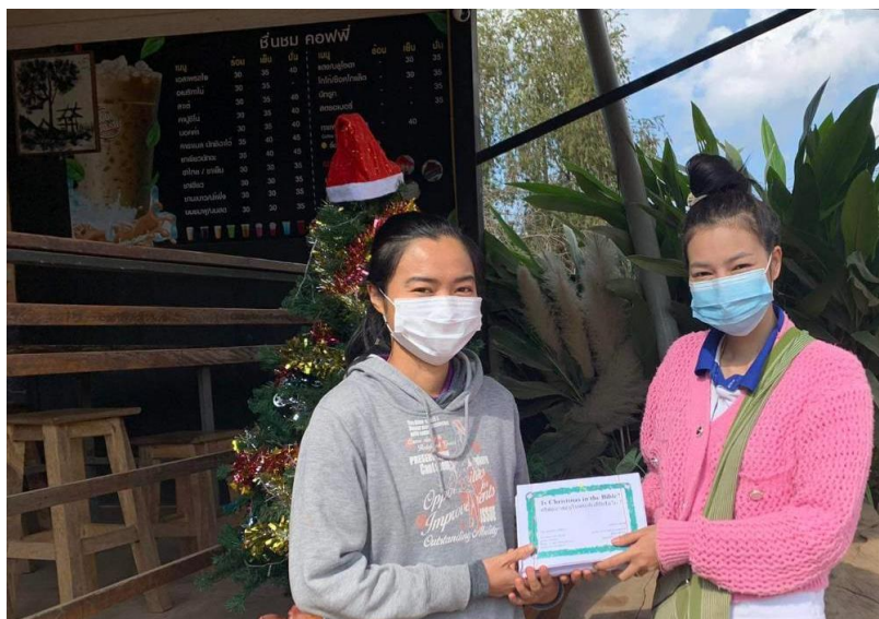
One of the many coffee shops in Chiang Mai.