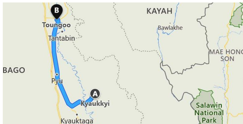
Kyaukkyi to Taungoo is 115 kilometers (71 miles) with the new roads of today. Our church compound is just 30 minutes farther by car.