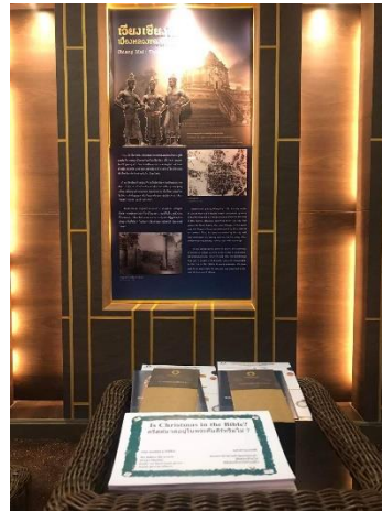
Chiang Mai City Arts & Cultural Centre.