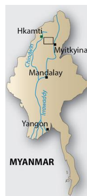
Square shows Jade Land.

Two days later we traveled to Jade Land where the bride and groom now live. The marriage ceremony was well done with a lot of people even in a hard time. The weather was so cold at Jade Land. There