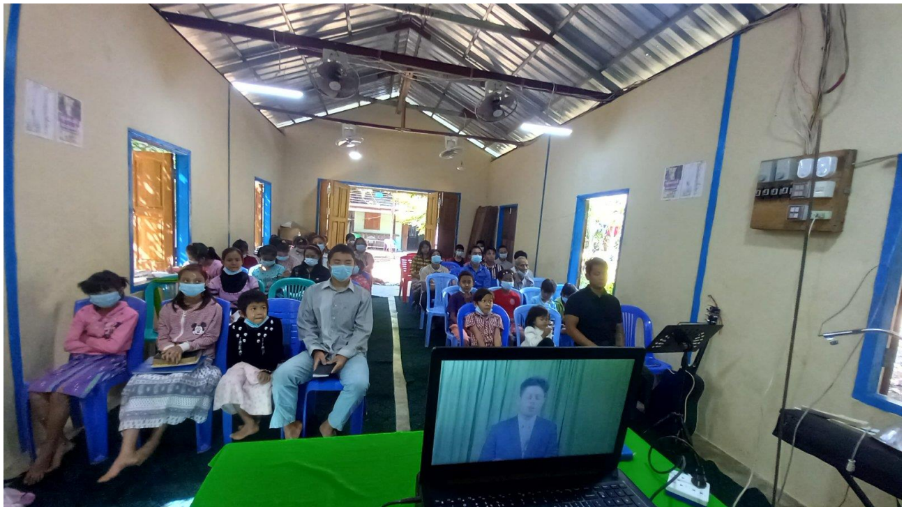
Pre-recorded 4-part video for brethren in Jawk Taing (and Facebook page 5 ) while Seng Aung visited brethren in Yangon.

PLEASE SEE BELOW OUR THANK YOU LETTER BY ANITA SHOWERS