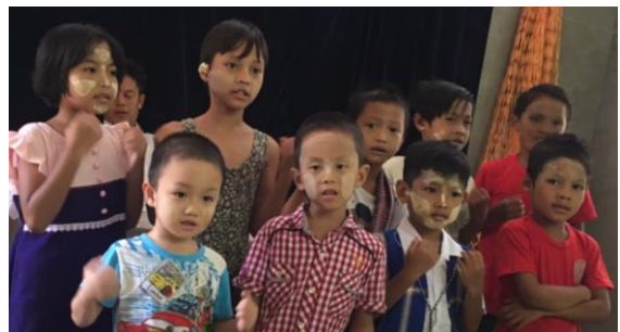
JawkTaing children sing on Pentecost.