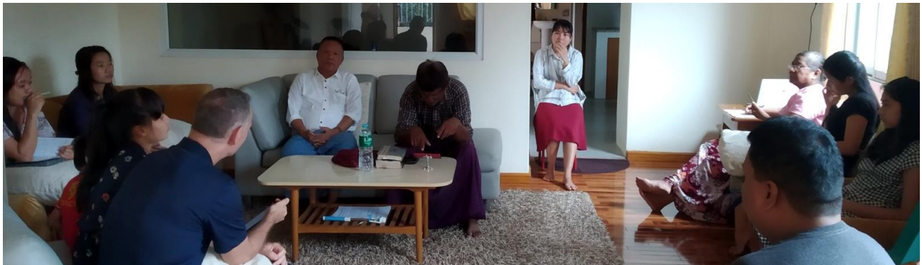
In Yangon, not all could meet for Pentecost, so here is last Sabbath with guests on 27 th June 2020.