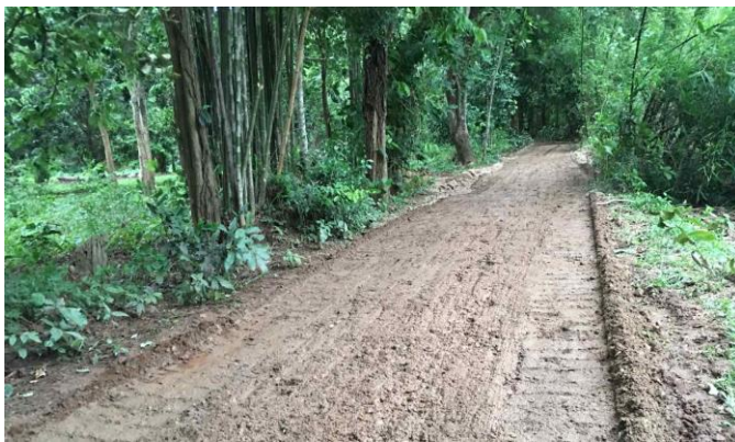
Beautiful completed road.

Last week this section of the wall was completed. It is fourteen feet in length with many more posts already in place.