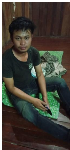
Karen man waiting for surgery at hospital. His son and daughter stayed at Legacy School.

Legacy also helped a Karen’ man who needed surgery, but lived very far away in the mountains. He is the relative of one of our workers. After surgery and release from the hospital no hotels, guesthouses, etc. would accept him due to the C. virus. Hospital rules dictate that a family member must stay with the patient, so