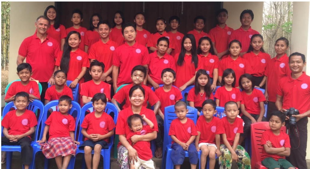
Group photo of 2020 spring youth program.