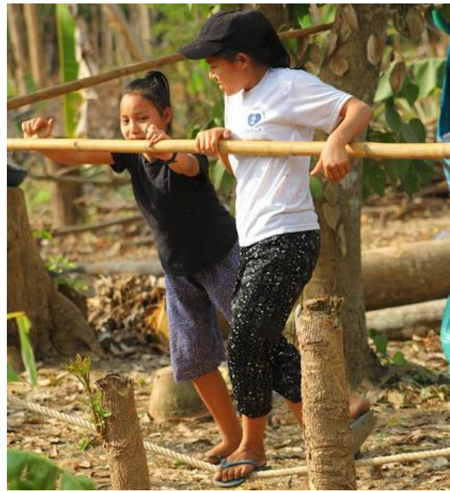
Tricky balance on obstacle course: AprilPaw and NinPalay