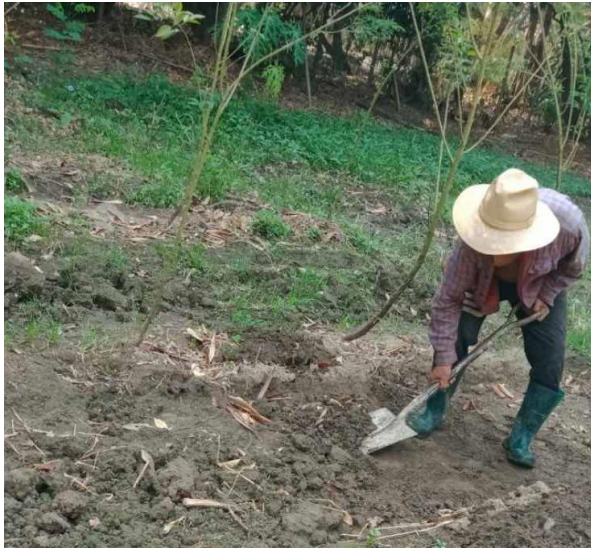
JoHtoo working more beds at Legacy Farm