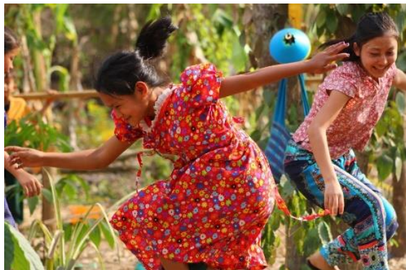
NayGayPaw and BweyMooPaw on obstacle course.