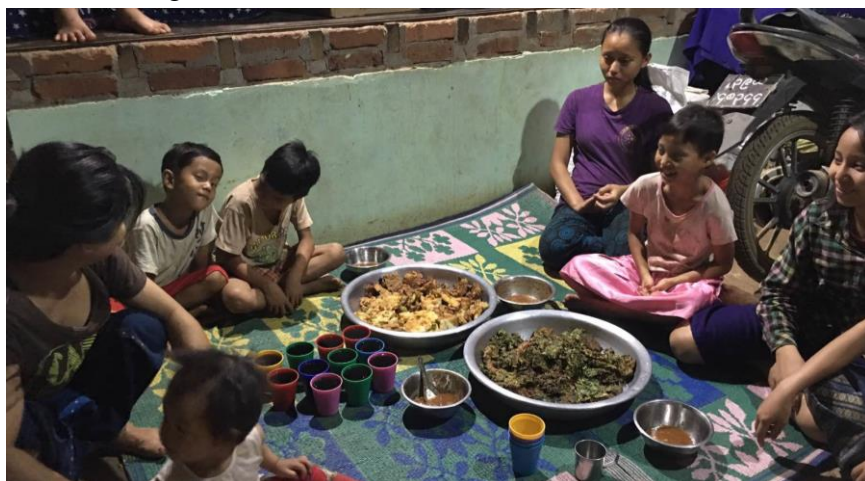
Last Day of Unleavened Bread celebrated with fried beef and Coca-Cola