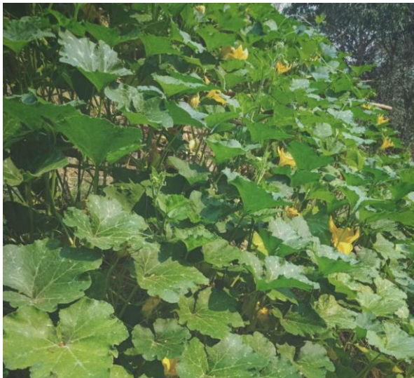
Pumpkins already in bloom.