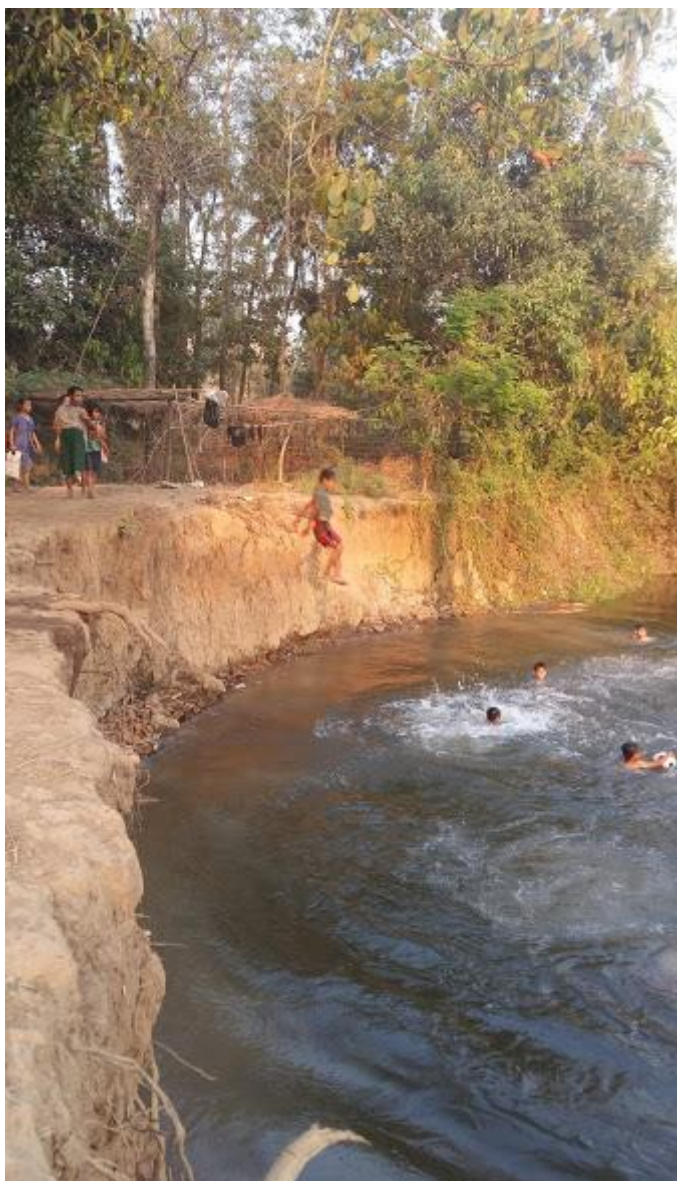
In this so very HOT season here was the perfect swim hole.

You will fall in love with the kids. They are so poor but they are wonderful, laugh a lot, are happy and really eager to learn new things. I am grateful to God for bringing me here and using these amazing people to teach me some valuable life lessons. I will treasure my memories from that one week of camp. It was wonderful and will have a lasting impact on my life. "