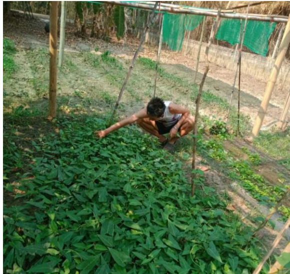
EhKaNayHtoo picking tender Pak-Boong at farm.