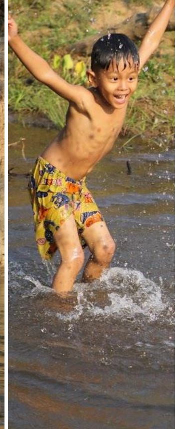
Splash by NawNaw