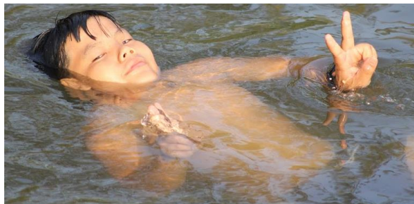
Blessing's sweet success after jump!