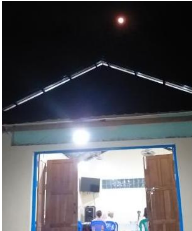
Before Passover ceremony with full moon over church building.