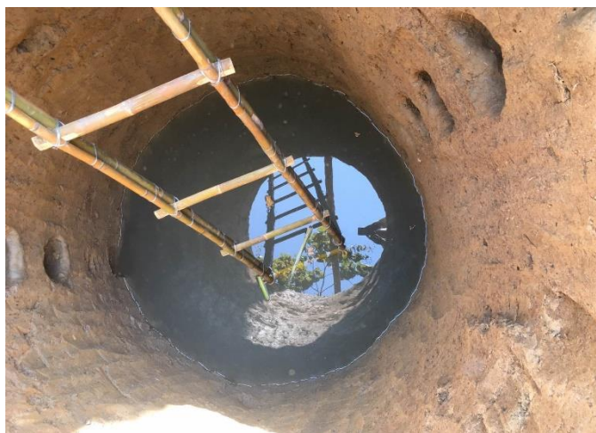
The well is nine feet deep.

existing trees on this land: Pomelo (pink and white), lime, lemon, coconut, banana, Marion (sweet and sour kind), three varieties of bamboo, plus some hard wood trees. A few trees are being transplanted, such as avocado and grapefruit. More planting will take place in the rainy season.