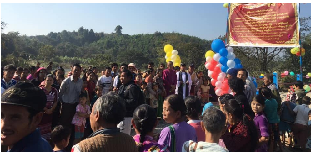
Celebrating the grand finish of Meta Bridge with officials