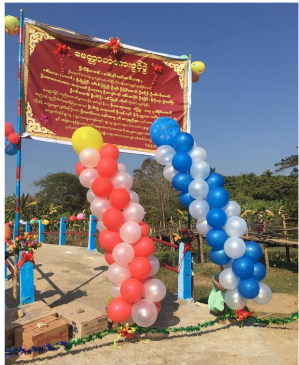
AFTER—12 January 2020