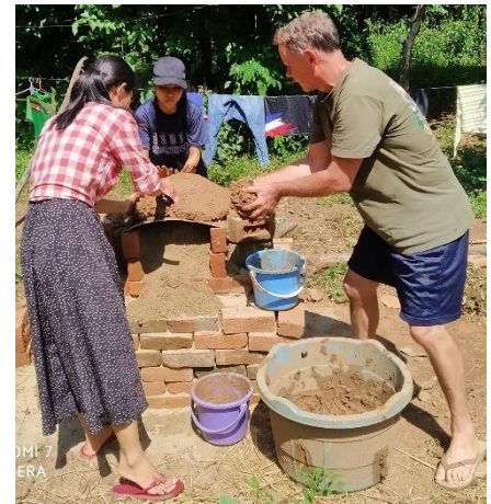
Clay oven almost finished.