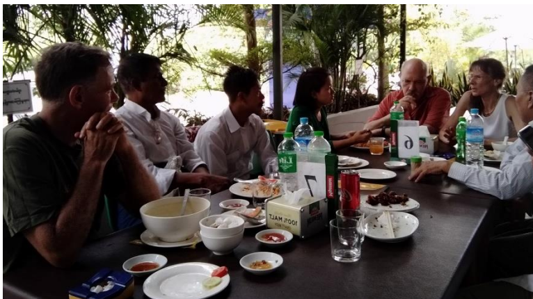
Evening dinner at the Pathi Hotel