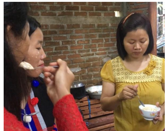
Concentration is on the yummy taste of ice cream

Lots of work went into completing the brick walls, and roof so that the food hall could be very comfortable for all of us feast goers. Now this building will end up with two floors. The first floor will be the Food Hall and the second floor will be a library, and place for classrooms, etc. Slowly but surely, one step at a time, the doors, windows, and floors will be completed. We'll keep you posted.