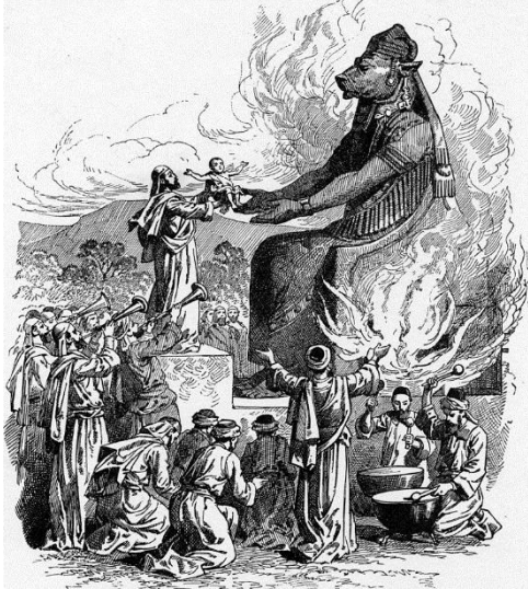
Offering to Molech 1

In closing, we are keeping up with the news around the world which is getting more and more like it says in Revelation. We are in the end times. So we are inserting one more recent piece of news.