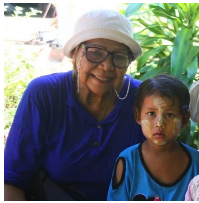
Utaiwan with child