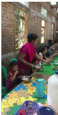
Meal time! Click to watch.