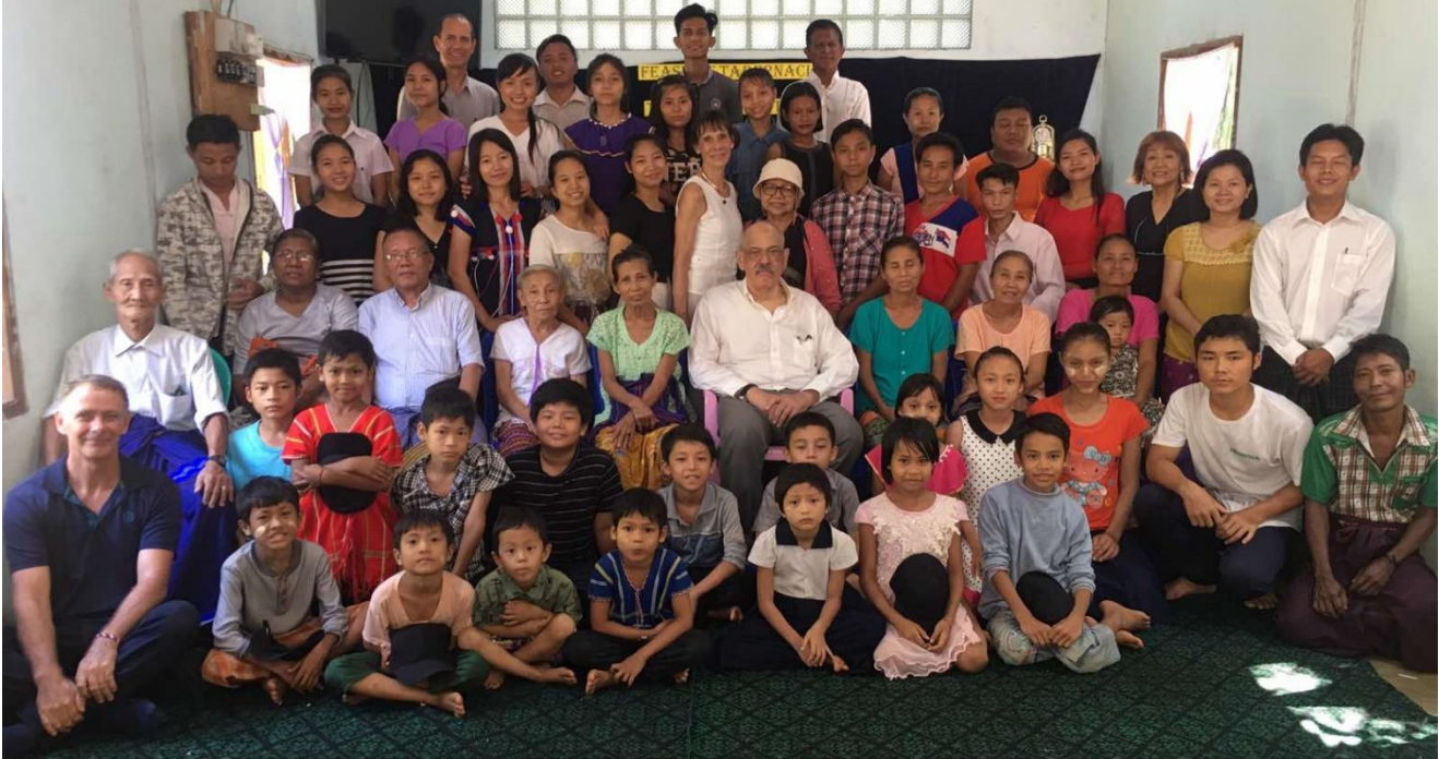
The eighth day—that great day of the feast—our memory for 2019.