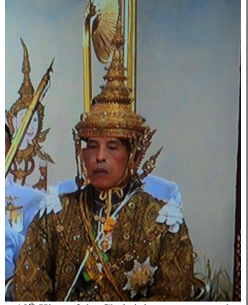
10<sup>th</sup> King of the Chakri dynasty crowned during coronation ceremonies, 4-6 May.<sup>1</sup>

P.O. Box 575, Monrovia, California 91016 www.legacyinstitute.org mail@legacyinstitute.org