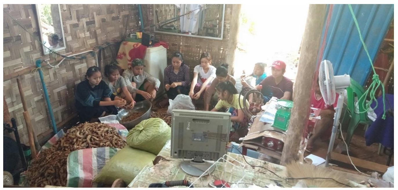
In turn for free classes, students generously helped pick, bag, and peel the sour tamarind which is used daily in so many dishes. Dishes are touched with salt, sweet, sour, and chili—all in one. Yum! But most were sold for a total amount of 140,000 ($92)—and that's from just one tree on church land!