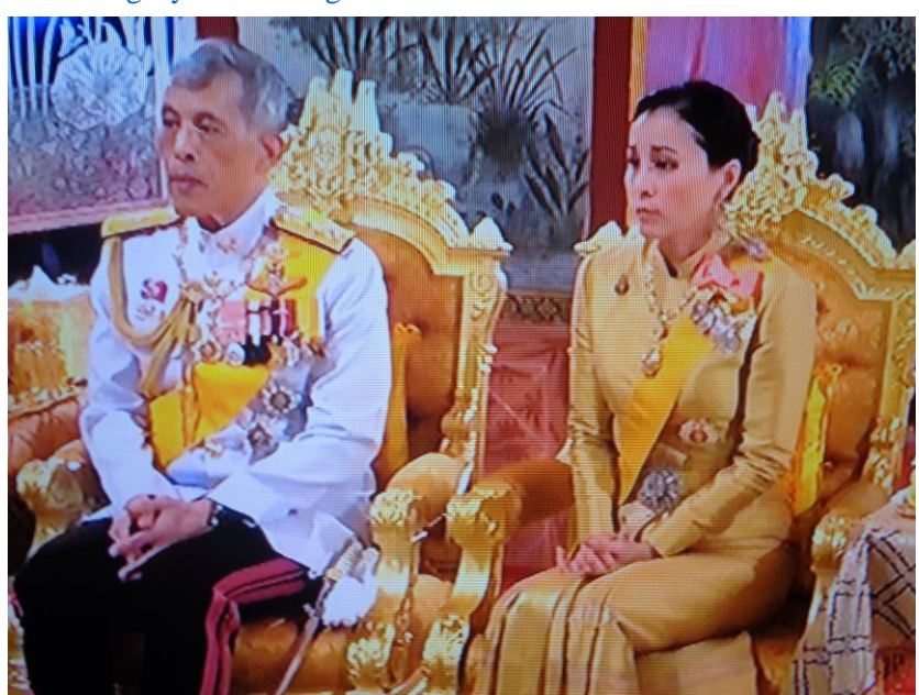
King Maha Vajiralongkorn of Thailand with Queen Suthida.