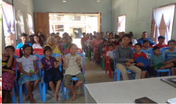
Worship services in JawkTaing church compound.

We are forever grateful to you for your constant prayers! We appreciate all your help in supporting Legacy as God continues to guide us. We regularly pray for all of you as we march forward together as Christian soldiers, preaching the gospel, and holding fast the TRUTH!