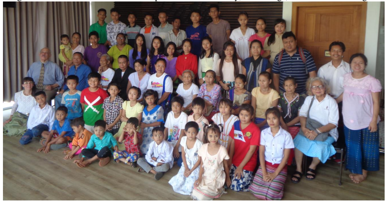
Last Day of Unleavened Bread

At the beginning of each service, SengAung gave a short message to all—though more specifically to the youth—equivalent to a sermonette. Then the younger youth (12 and under) would leave with SengPan to attend their Bible classes to practice Bible memory, more songs, and other Bible fun games.