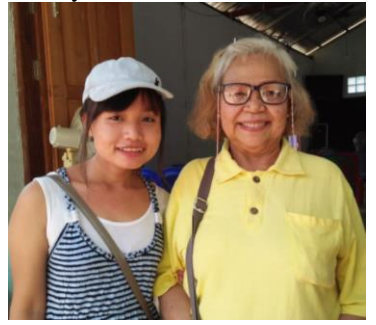
HserNaySay also stayed with Utaiwan