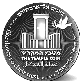
New coin minted to fund building Jerusalem Temple. 3

It has been the Jews who have the concern of President Trump being the second Cyrus, not the administration in Washington. Just take a look at the newly formed half shekel for the people who want to build the Third Temple. In Jewish history, every male must give a half shekel to pay for maintenance of the Temple. Those who have a strong belief in Trump have asked him to come and rebuild the Temple. Notice on the coin the picture of Trump with the picture of King Cyrus in the background.