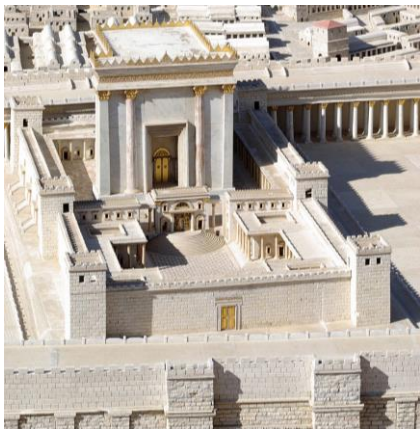
Model of Herod's Temple (renovation of Second Temple) in the Israel Museum. 6

Both the Jewish peoples and the Muslims are the children of Abraham. By Hagar (the Egyptian princess and helper of Sarah) was born a son named Ishmael. By Sarah was born Isaac. This was the beginning of their troubled history that continues until now.