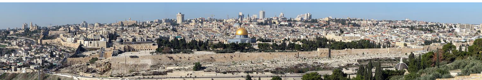
Panorama of the Temple Mount, including Al-Aqsa Mosque and Dome of the Rock, from the Mount of Olives. 1

Will President Trump be involved in the building of a third temple?