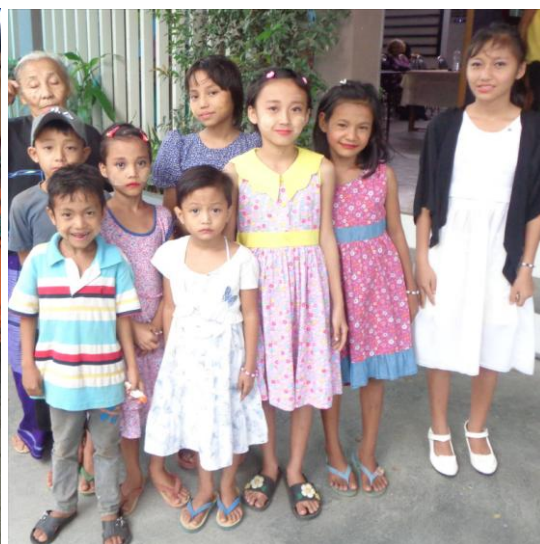
Children received new-used clothes on Family/Talent Night.