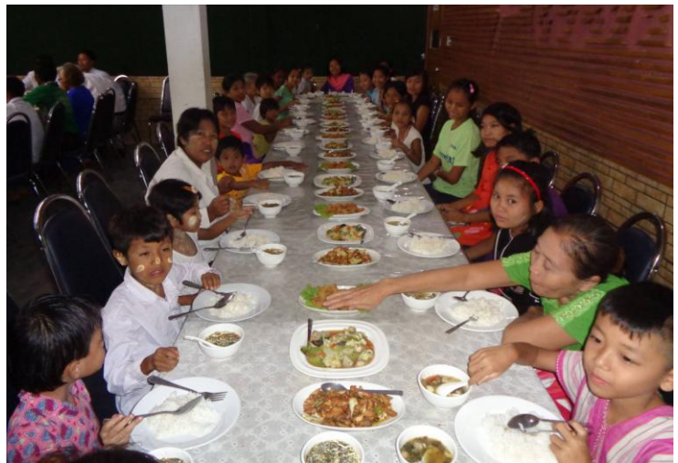
What a fantastic FEASTING dinner at Pathi Hotel on the Last Great Day—which was provided by our Karen' COG members from another part of our Globe. One thing this picture does not tell you is that no one ate their meals as traditionally done in JawkTaing—with their hands. Did we even think that this might be a difficulty? But all did fabulously!