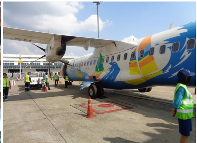
Hello Chiang Mai. Our twin engine prop plane had just landed.