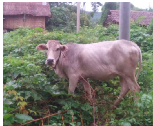
The beautiful cow. It is not a hefty "Texas cow", one can actually see a few ribs. But it's all natural and there is still meat for more special days to come.