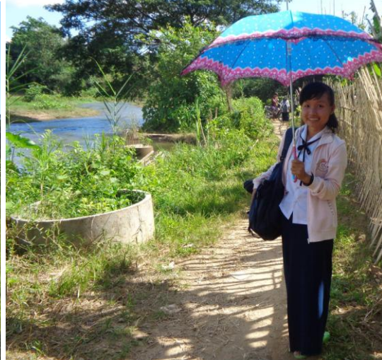
Still in school uniform, children hurry over the bridge-crossing for worship services. HserNaySay after bridge crossing.