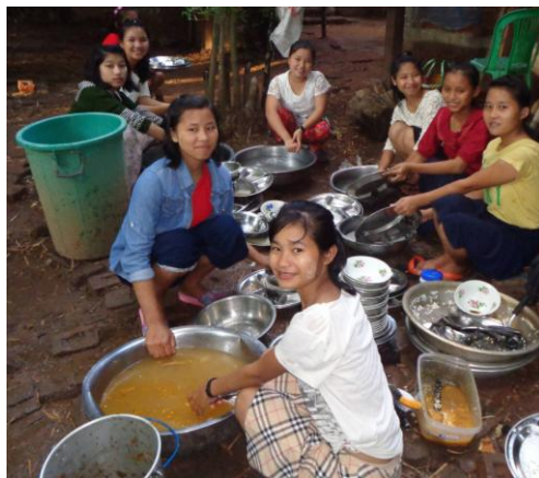
Were we ever so happy?! Dishes cleaned after dinner by our students.