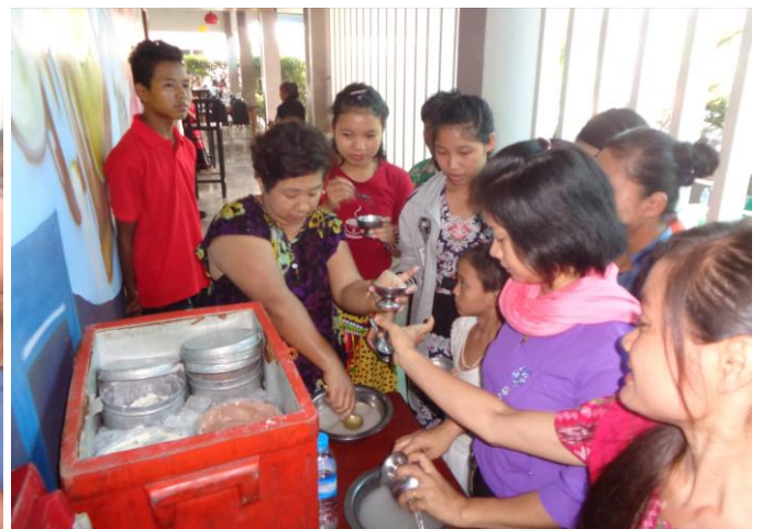
ICE CREAM—ICE CREAM—WE ALL LOVE ICE CREAM! Just look at their expressions!☺