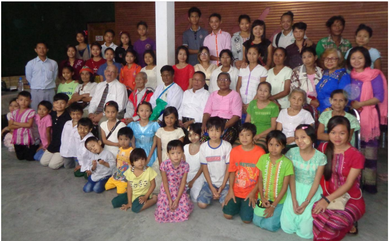
Last Great Day group photo