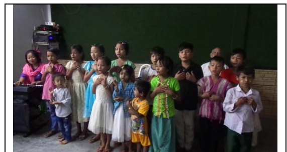
Last Great Day music: “ God Wants a Pure Heart ” (Burmese language) by our little children