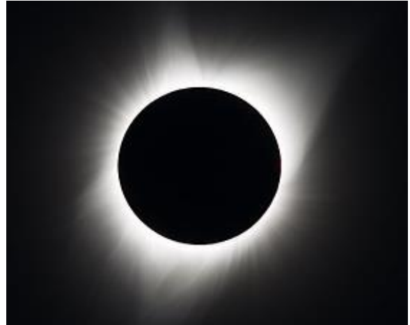
Solar eclipse of 21 August 2017 4

On August 21, there was a total solar eclipse that could be seen most clearly across the U.S. from the Northwest to the Southeast. The last time the path of a total solar eclipse made landfall exclusively within the United States was in 1776. This year, it also happened on the day just before the beginning of the Hebrew month of Elul on the Sacred Calendar. Elul 1 begins the 40 days of repentance that the Jewish people observe before Yom Kippur (the Day of Atonement). This is significant. Why? Because God uses signs in the heavens to warn us about significant events 3 . I believe this particular heavenly event is a CALL TO REPENTENCE for America.