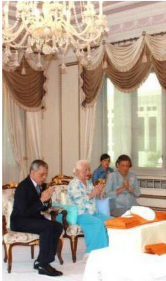
12 August 2017 Her Majesty Queen Sirikit's Birthday and Thailand's Mother's Day 1