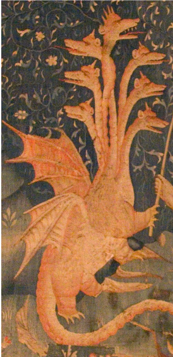
A cropped picture of a medieval tapestry depicting the seven-headed beast of Revelation. 1