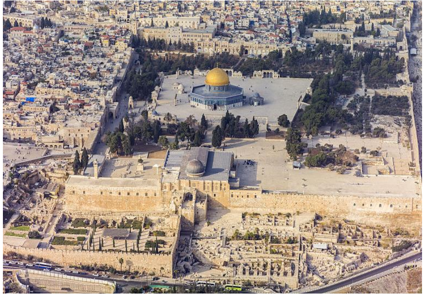
Temple Mount in Jerusalem (Holy Land) 1

Why is there so much animosity by Muslims shown toward Israel and the Western nations? Some people try to blame it on the Crusades, but it goes far deeper than the battles between the Franks and the Muslims for control of the Holy Land in the eleventh and twelfth centuries. Some say it is because of different religious beliefs. The Jews and Christians worship the God of Abraham, Isaac, and Jacob. The Muslims worship Allah.