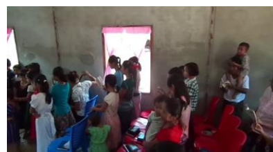
Stellin directing music