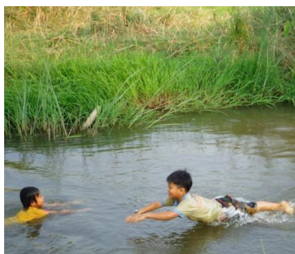
Hurry! A quick splash in the 110° heat.