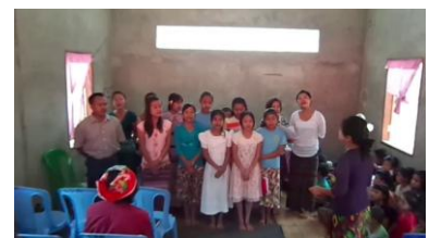
Older youth singing