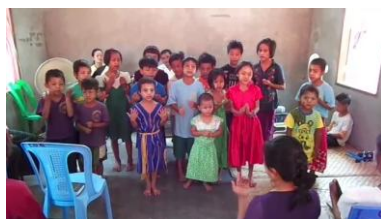
Youth singing special music