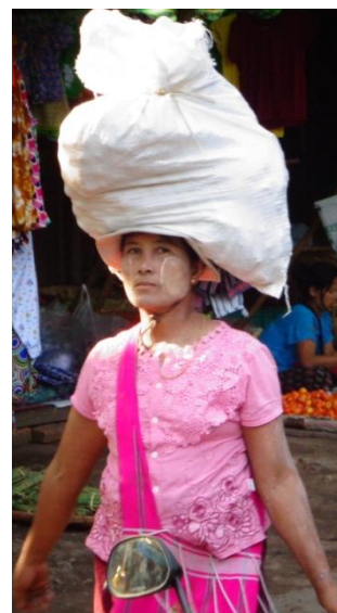
Lady carrying her load.