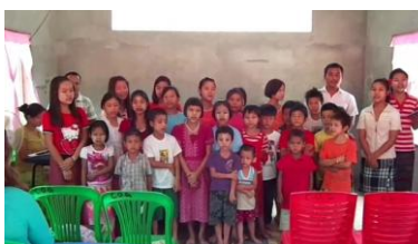
All youth singing