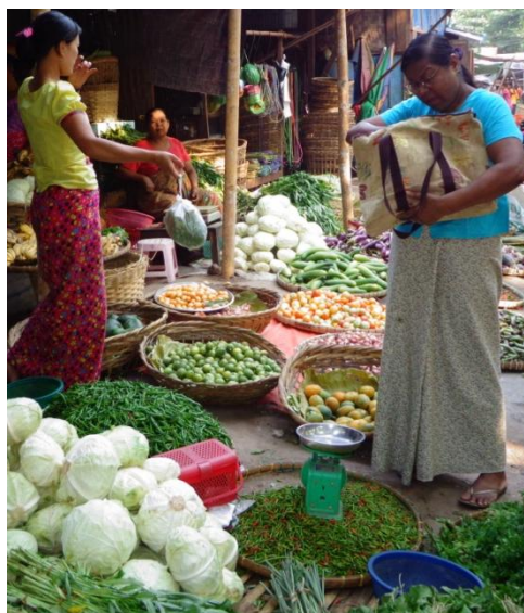
TooMar paying for special veggies and fruits. What is not on the photo are the many odors of every kind—some good—some not good.