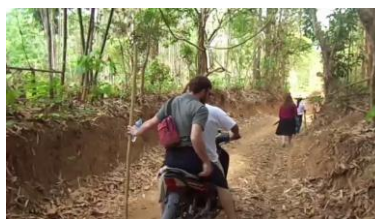
To ride or not to ride