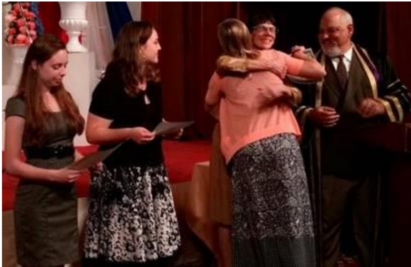
Legacy volunteer teachers given certificates for their appreciated time of service and sacrifice.