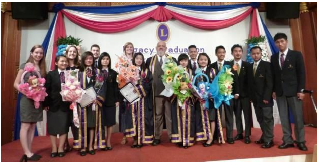
Legacy students and volunteer teachers at our eighth commencement exercise.