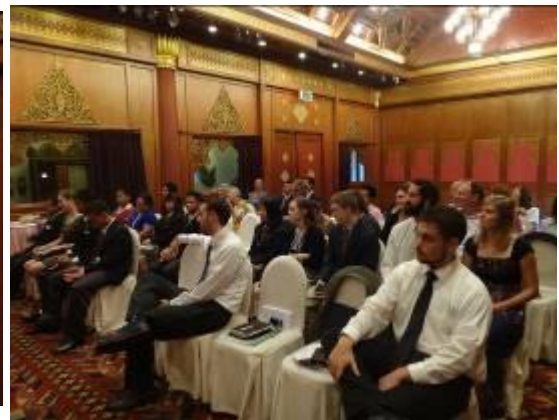
Worship services in the beautiful Empress Hotel Petcharat room.