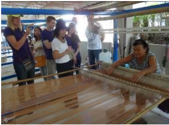
Silk weaving at Queen Sirikit's Royal Project, and