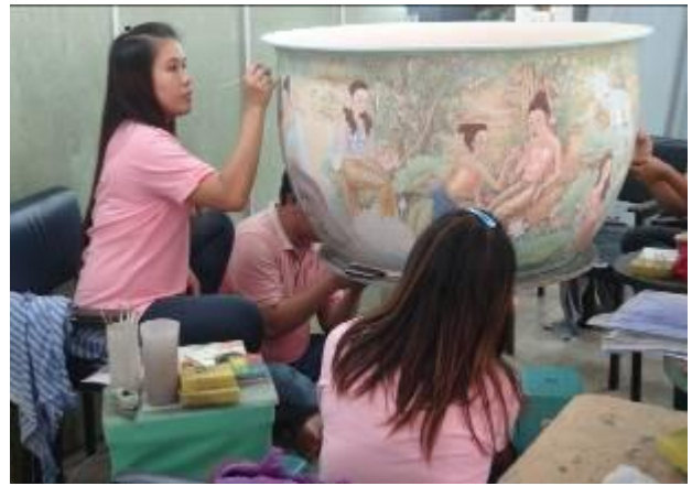
ceramics from the natural white clay in the local area.