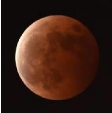
8 October 2014, blood moon total lunar eclipse in Hefei, east China's Anhui province. 1