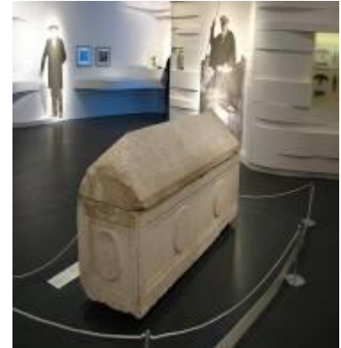
Sarcophagus of Helena of Adiabene in the Israel Museum. 2

I wrote a letter several months ago about the blood moons that are to appear on Passover and the high day of the Feast of Tabernacles in both 2014 and 2015. According to Jewish belief, a tetrad like this portends that something very significant will happen to Israel, such as war. It happened during the founding of the State of Israel and the 1967 War, as two examples. If we look at the