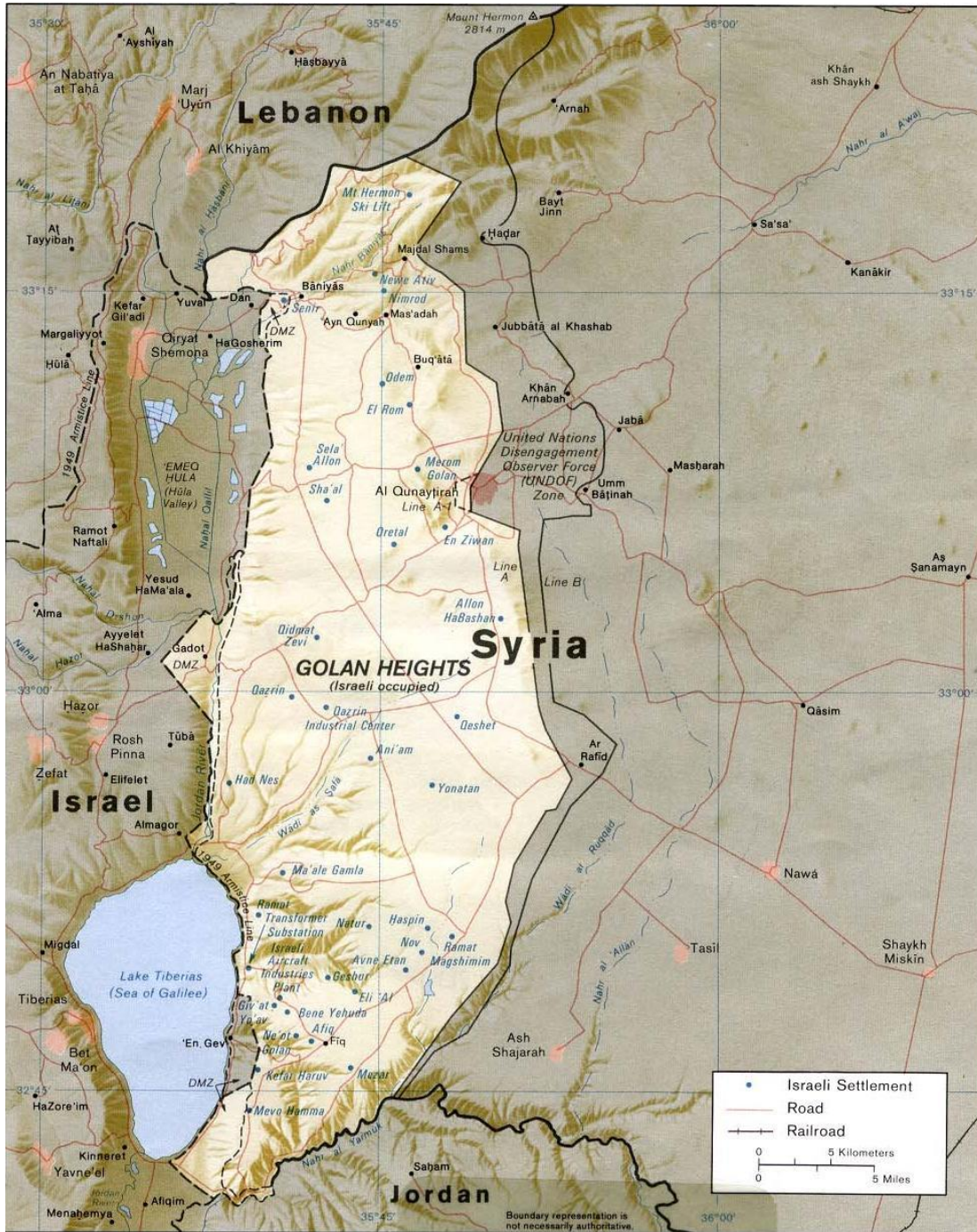
CIA Map of the strategic Golan Heights. 3

The U.S. has sown the wind and is reaping the whirlwind.