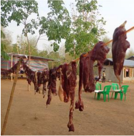
Drying the goat meat.