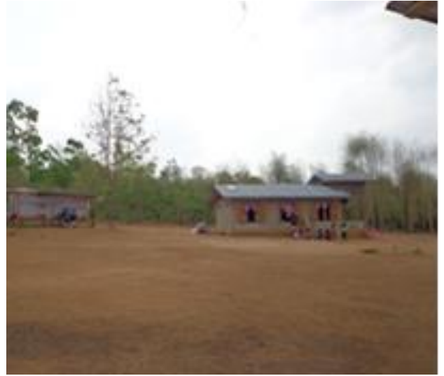
Temporary housing for men and COG building