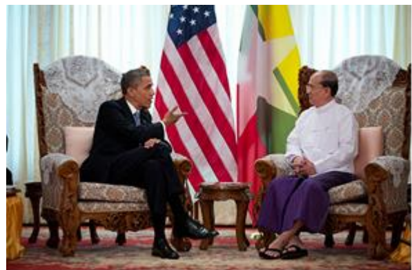
19 November 2012, U.S. President Obama talks with Myanmar President Thein Sein 1

This small country of over 61 million is very rich in natural resources, including gems, gold, oil, and gas. It remains a patchwork quilt of many different ethnic groups making up what is officially called the Republic of the Union of Myanmar. It has a new capital, new constitution, new national flag, and seeks to be accepted by the international community of nations. In 2005, then incoming U.S. Secretary of State Condoleezza Rice called Myanmar an “Outpost of Tyranny.” Myanmar is feverishly trying