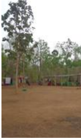
Cooking and eating area