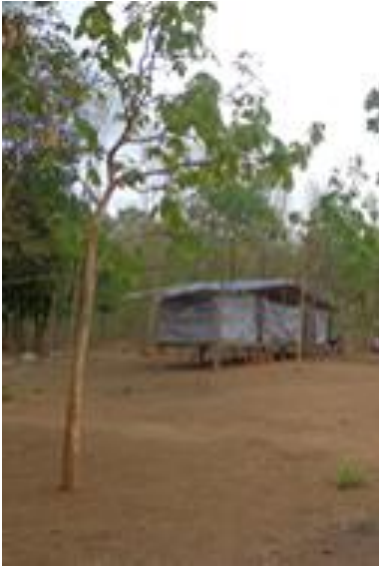
Temporary housing for ladies