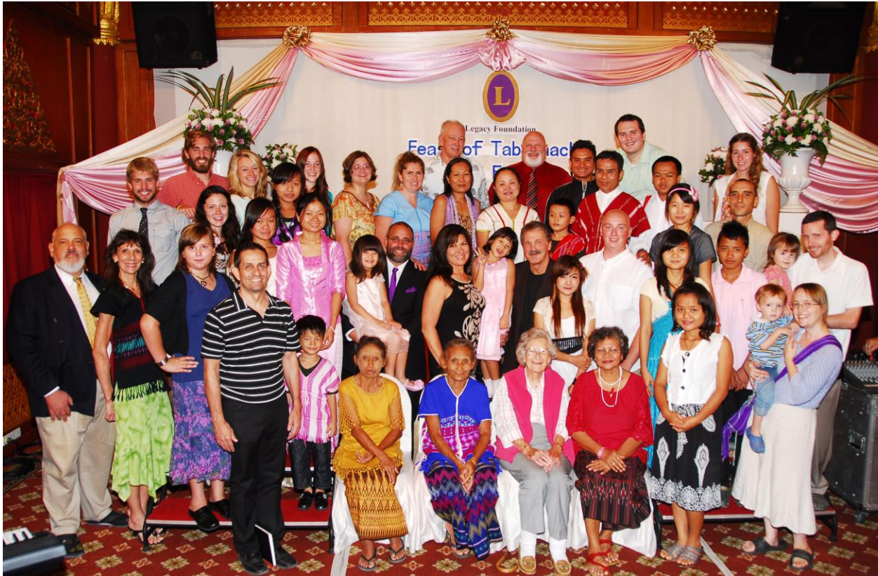
Group Photo Feast of Tabernacles 2013 Empress Hotel