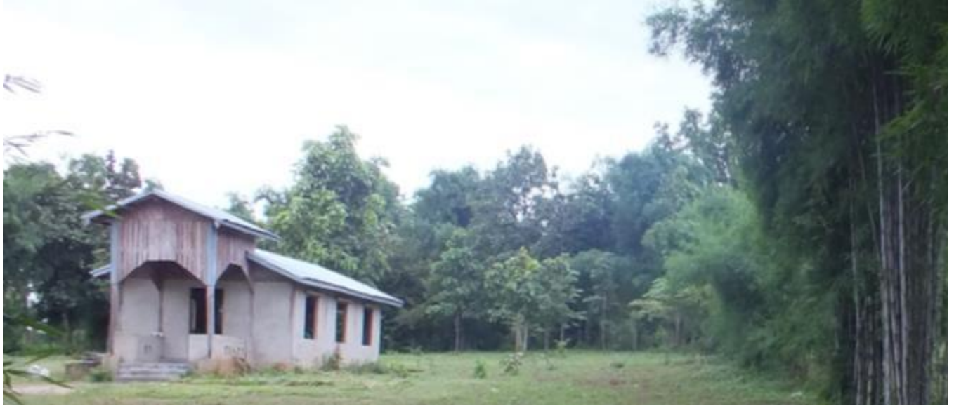
Jauk Taing church building on donated land