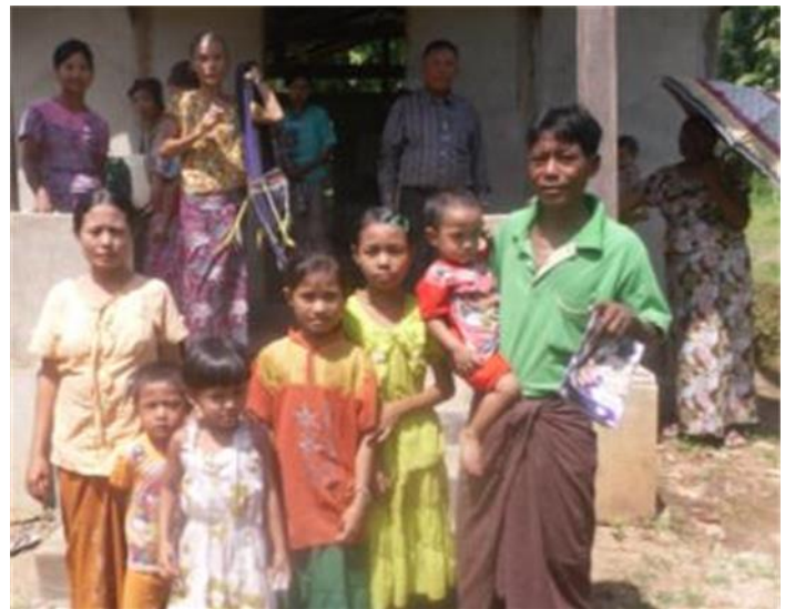
Jauk Taing congregation leaving services

● Jauk Taing Congregation in Burma Update