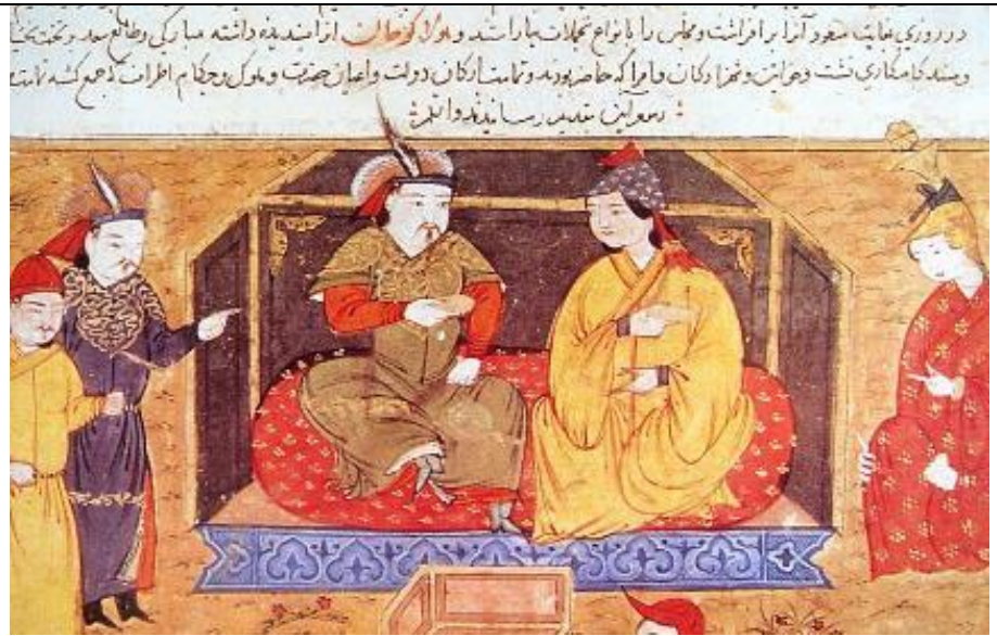
Hulaku Khan, Conquerer of Damascus (seated L), and one of his queens, Doquz Khatun.