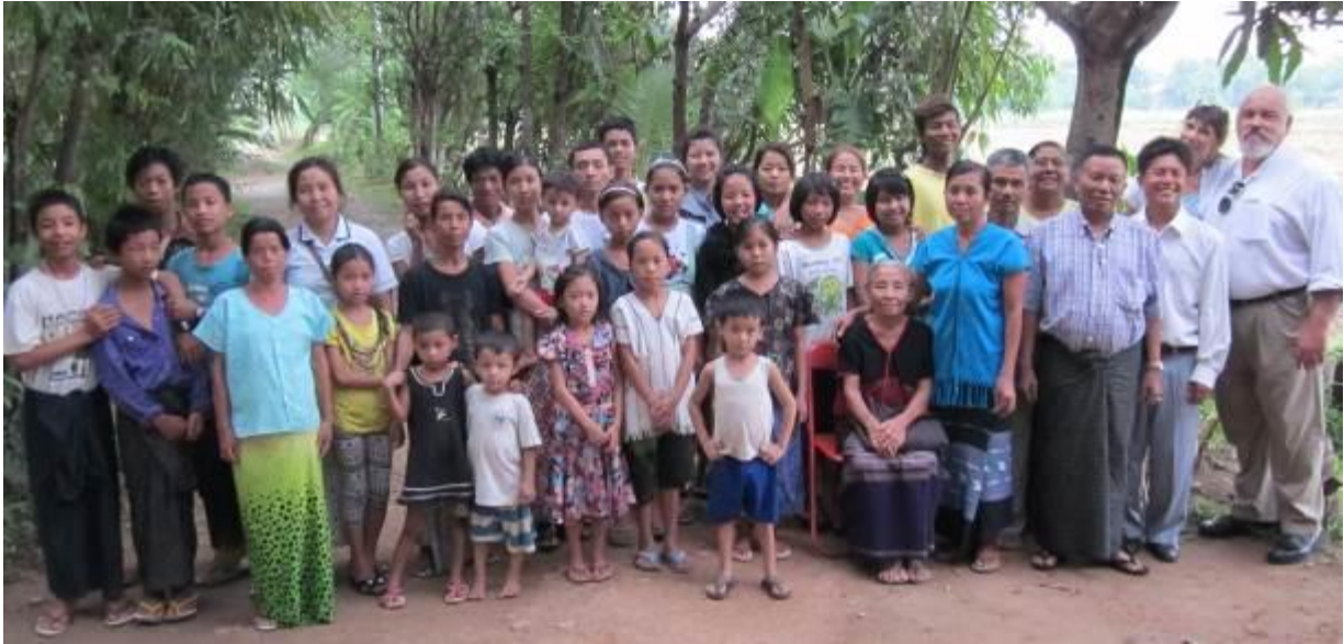
Group photo after Pentecost Services

P.O. Box 575, Monrovia, California 91016 www.legacyinstitute.org mail@legacyinstitute.org