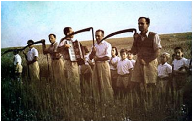
Preparing to harvest the grain. 1

Beginning the day after the weekly Sabbath between the two high holy days of the Feast of Unleavened Bread, a special ceremony was conducted by the high priest according to the rules given to the Old Covenant church of God 2 . It was called the wave sheaf offering .