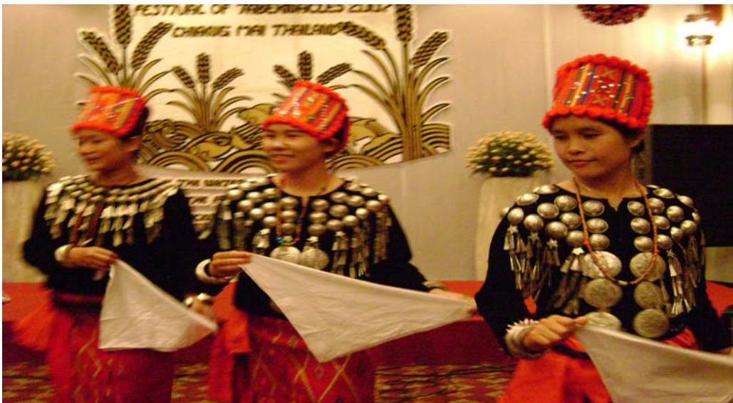
Kachin girls perform traditional dance at the Feast of Tabernacles