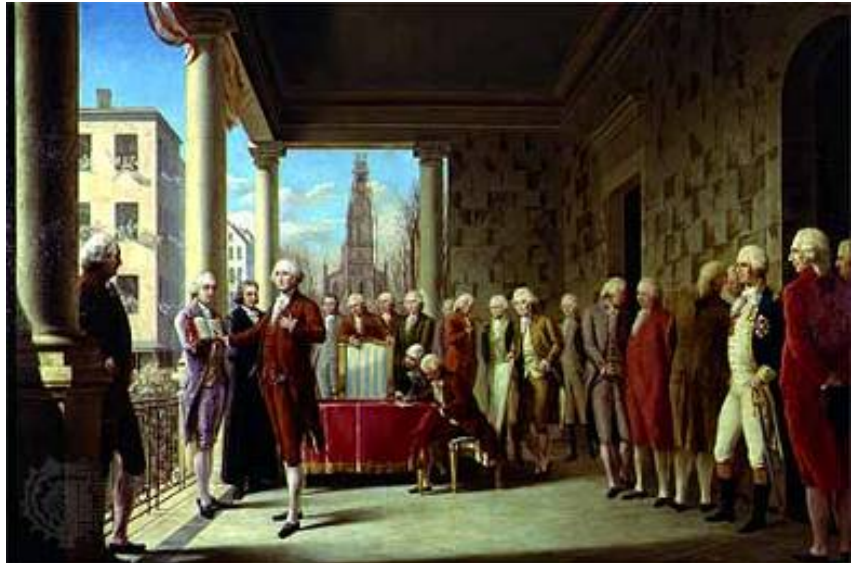
First Inauguration of George Washington, April 30, 1789 1

We pray for blessing . . . But true blessing only comes in the will of God. So the truth must be spoken as well—we must pray according to the truth and we must not be afraid to speak the