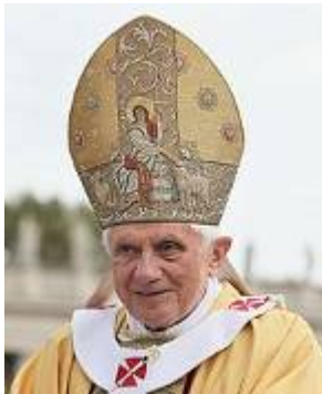
Pope Benedict XVI, 2010 2

P.S. On February 28 th Pope Benedict XVI will resign. The election of the next pope is supposed to take place before Easter. Who will be the next pope? The winds of change continue to build toward the coming storm.