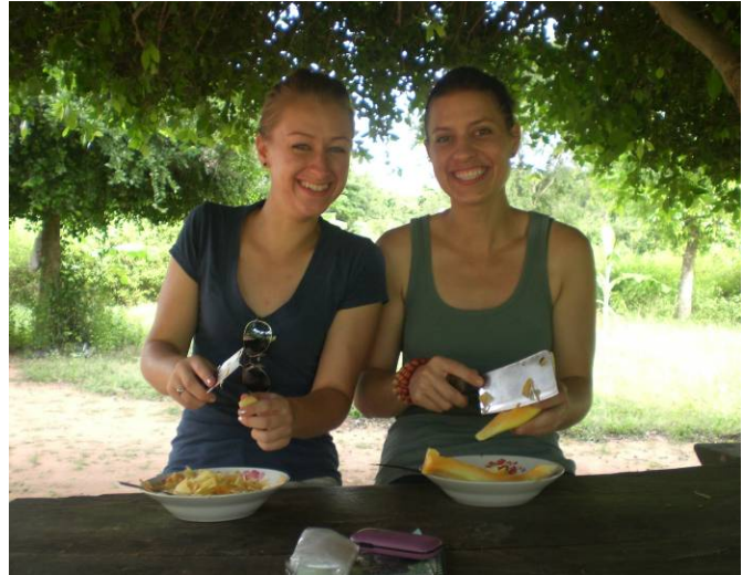
At Legacy garden enjoying the tropical Malagaw (Papaya)

While much of the Christian and post-Christian worlds were busy rushing about in last-minute preparations for Christmas celebrations, an important event took place in Brussels, Belgium, that went largely unnoticed and unreported. Leaders of the European Union and Russia met in Brussels on December 20 and 21 for the 30 th EU-Russia Summit, continuing a process of convergence and interdependence that is leading toward political, economic, and social merger 1 .