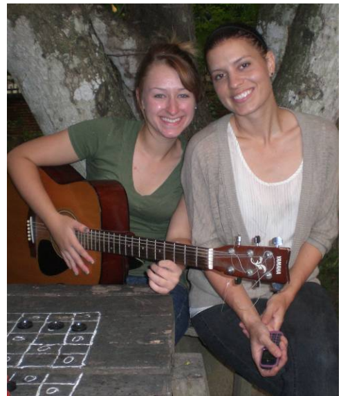
Relaxing musical moment

In addition, a male teacher to help serve here at Legacy with the same above qualifications would be a great help to set the right example of Christian leadership for the male students.