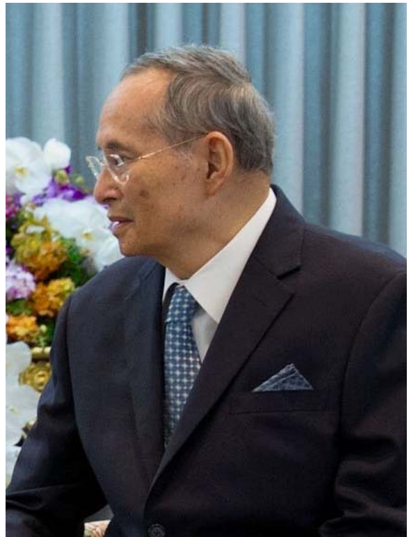
Photo of His Majesty King Bhumibol Adulyadej Rama IX taken in December

It is not well known that, even though Thailand's monarchy is constitutional and the king has no real political power, his influence is far-reaching because of his over 60 years of service to the country. He has visited every province in Thailand and initiated thousands of small, self-help projects to raise the quality of life of the people. Thais from all walks of life actually love their king because he has sacrificed his life for them. Many years ago, he even contracted a rare heart infection during a visit to a remote border area while his immune system was run down.