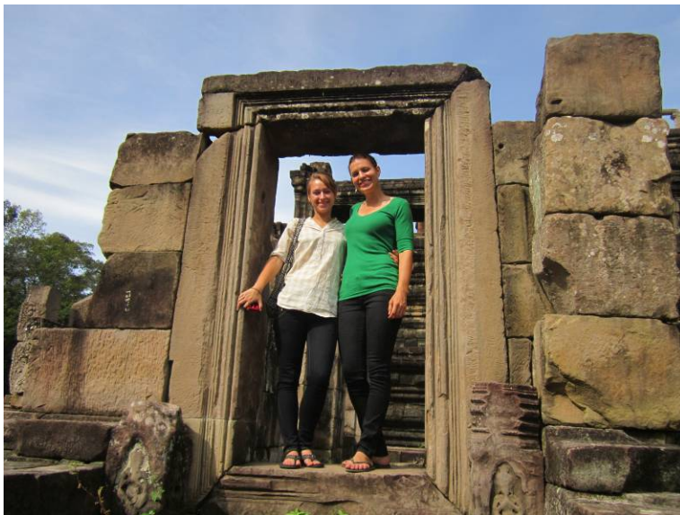
While on Visa Run: Ruins of Angkor Wat in Cambodia