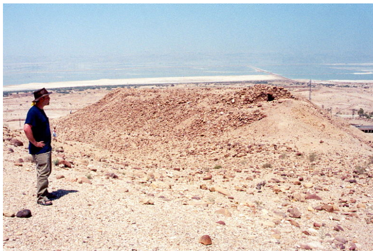
Numeira overview to west. 1 Likely site of Sodom.

The entire areas of Bab edh-Drha and Numeira are covered with a spongy ash. These two cities show clear signs of utter destruction.