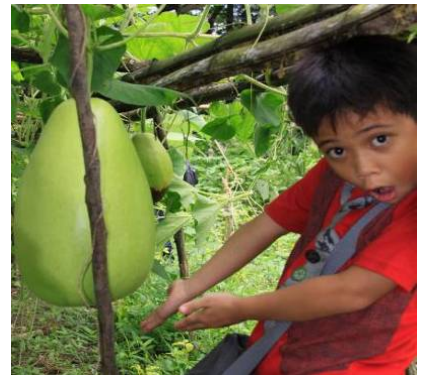
Ghourd bigger than David's head