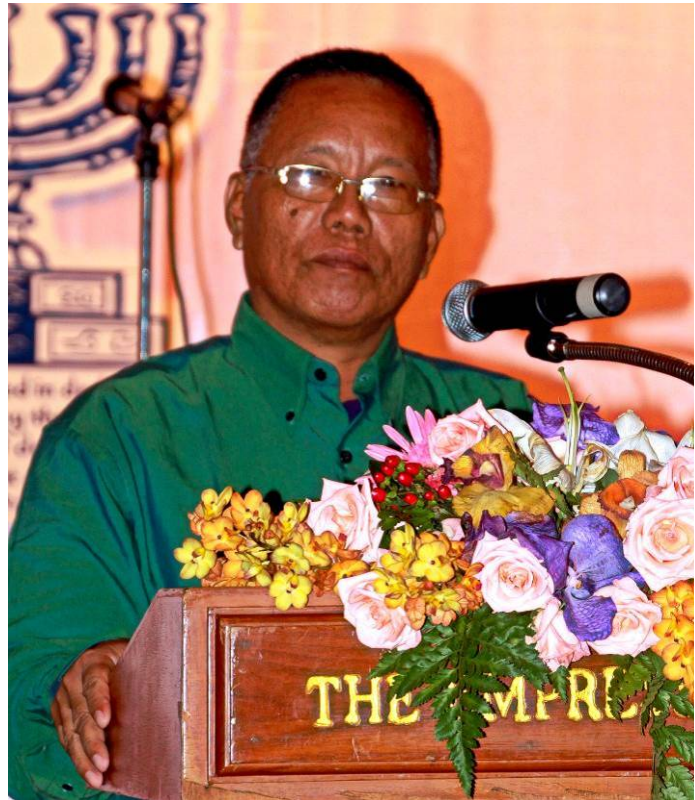
U. MyoZaw speaking in western dress.