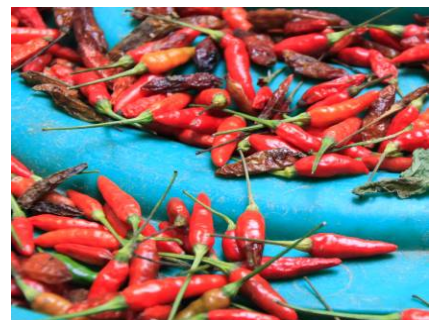
Drying the loved chilies