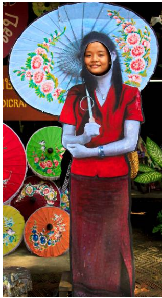
SeyNeeHtoo at Umbrella Ctr.