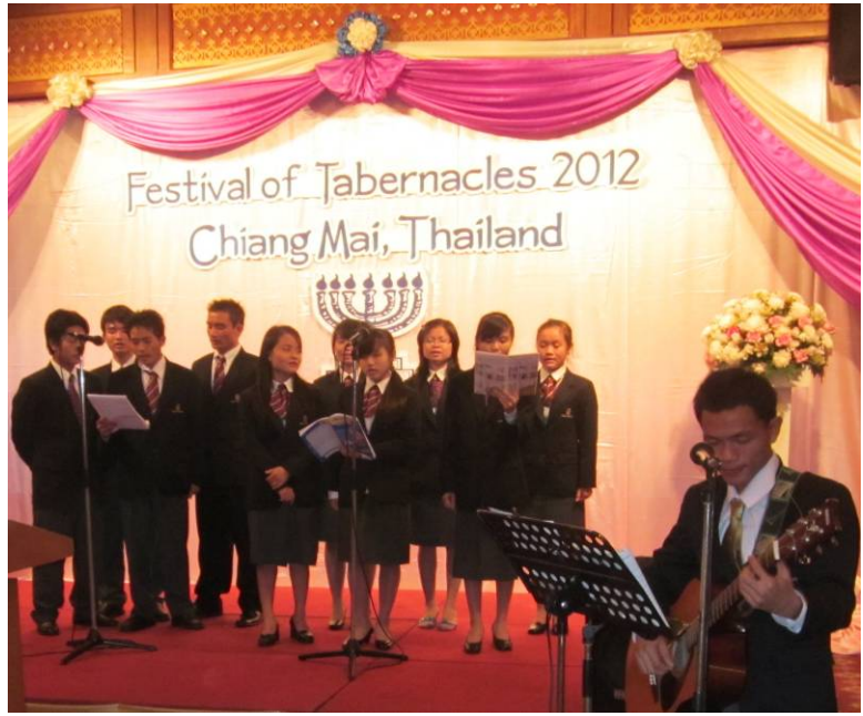
Legacy choir in dress uniform with Bancha on Guitar

The brethren in this part of the world are poor and save little or no festival tithe. The lion's share of all offerings on the Holy Days comes from western members who may be attending. How does one budget for a Feast attended by the poor who can contribute only the widow's mite?