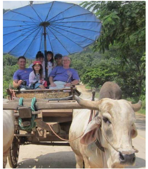
Oxcart ride in millennial setting.