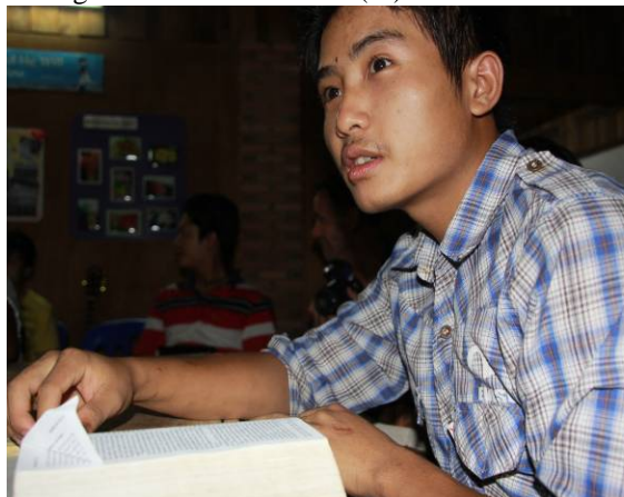
MoePlay at Fri. evening Bible game and singing.