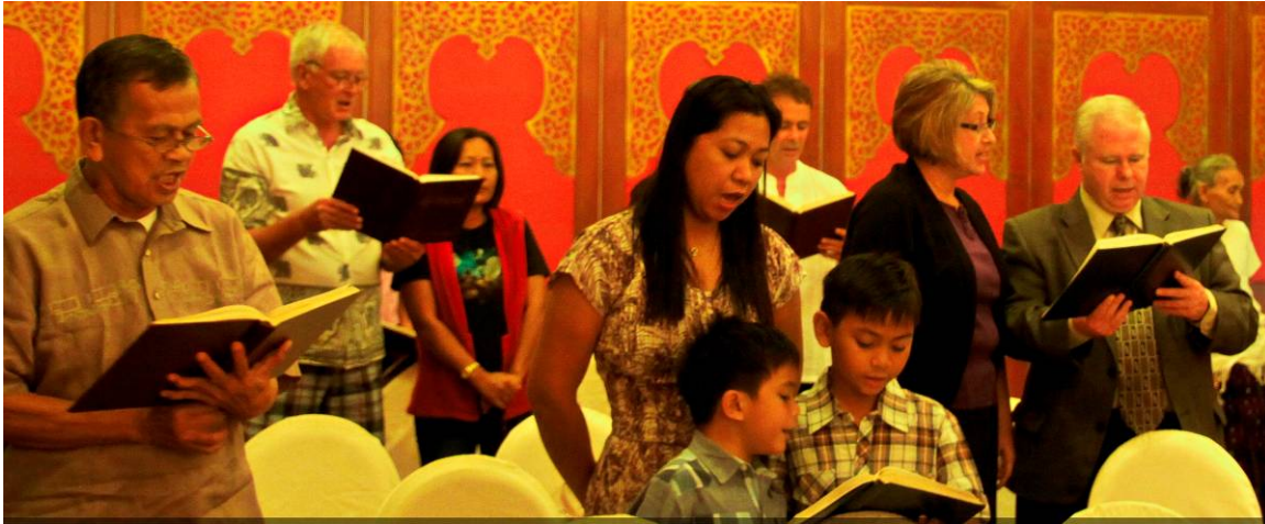
2012 Feast of Tabernacles in Chiang Mai, Thailand