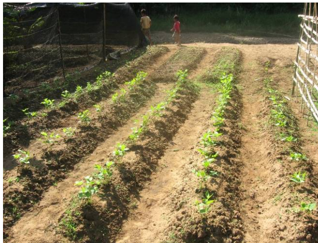
New Legacy Farm plot.

We also are working feverishly to increase our level of production in organic vegetables. We recently visited one of the King's projects in Chiang Mai and they are very happy to supply us with many varieties of vegetable sets and fruit trees. We just completed building water tanks to supply water for a new garden plot on about half an acre we were able to acquire. My goal is to achieve 100% self sufficiency in vegetable production by the end of 2012. This is ambitious because we currently grow only 30% of the vegetables we consume at the school. Everything takes time.