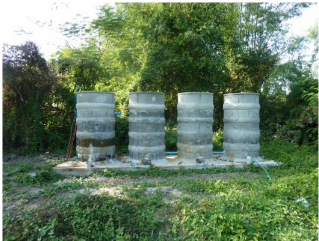
Newly built water tanks.