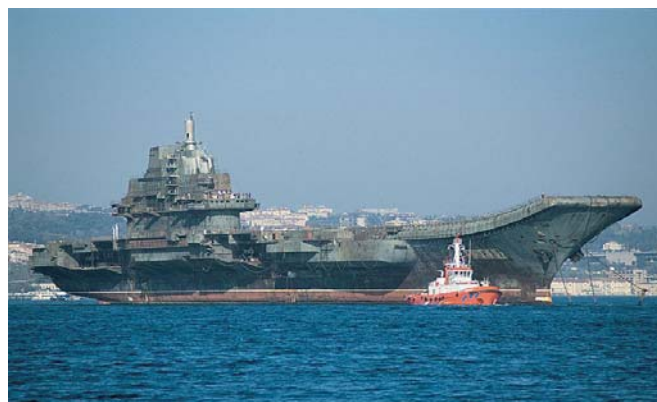
China's refitted aircraft carrier "Varyag" in Istanbul Harbor 4

China is presently sea testing its first aircraft carrier, a refitted Russian ship purchased from Ukraine. For those of you not familiar with warships, an aircraft carrier is an offensive platform —NOT a defensive one. Jets flying off of a Chinese aircraft carrier could carry nuclear tipped cruise missiles.