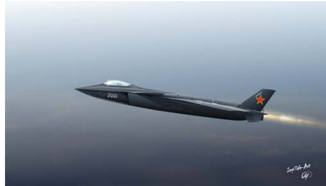
Artist's rendering of a Chinese J-20 stealth fighter. 5

The days of American hegemony over most of the world will soon be over.