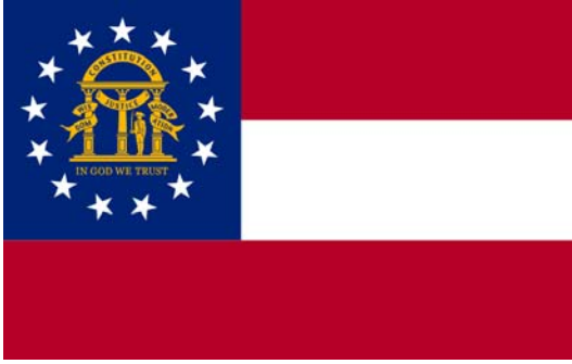
Flag of the State of Georgia with motto