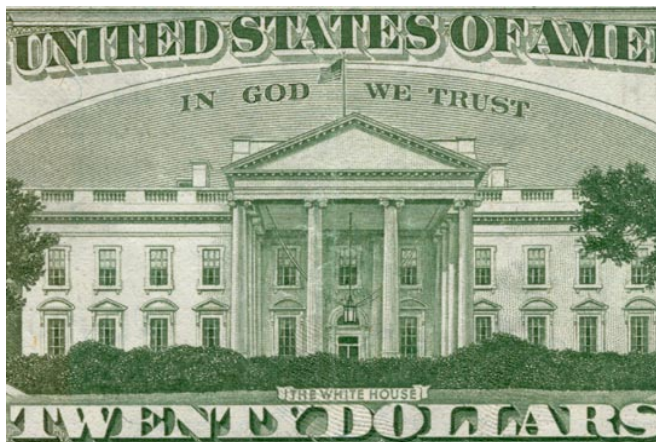
The National Motto of the United States of America flies over the White House on the Twenty Dollar bill. 1

This has been the official national motto of the United States since signed into law by President Dwight Eisenhower in 1956, but the words “In God We Trust” have appeared on U.S. coins since 1864. It was during the dark hours of the War Between the States that Treasury Secretary Salmon P. Chase pushed to adopt the motto and place it on U.S. money. He wrote to the Director of the Philadelphia Mint in an 1861 letter, “No nation can be strong except in the strength of God, or safe except in His defense. The trust of our people in God should be declared on our national coins.”