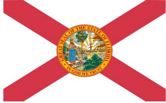
Flag of the State of Florida with motto

Recently the words “In God We Trust” had to be reaffirmed as our national motto by an act of Congress.