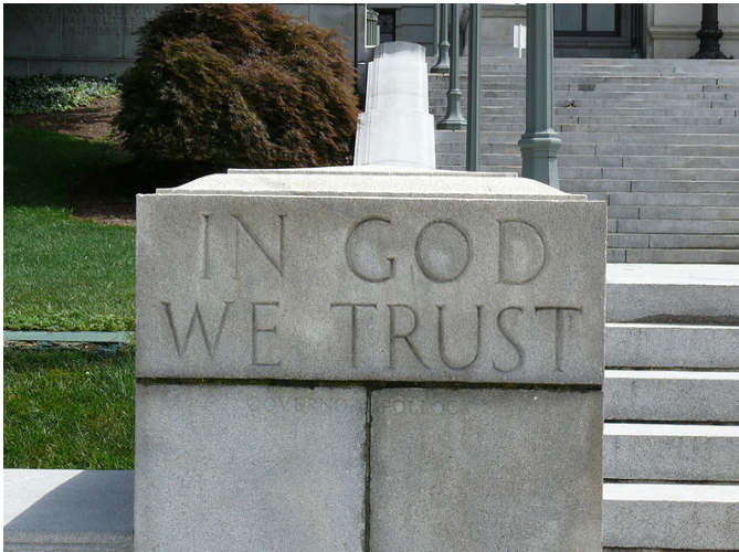
National Motto prominently displayed in front of the Pennsylvania State Capitol

An article from the Christian Science Monitor explains: The House on Tuesday passed a non-binding resolution reaffirming “In God We Trust” as the national motto . . . The measure sponsored by Rep. Randy Forbes, R-Va., supports and encourages the motto's display in all public schools and government buildings. 2